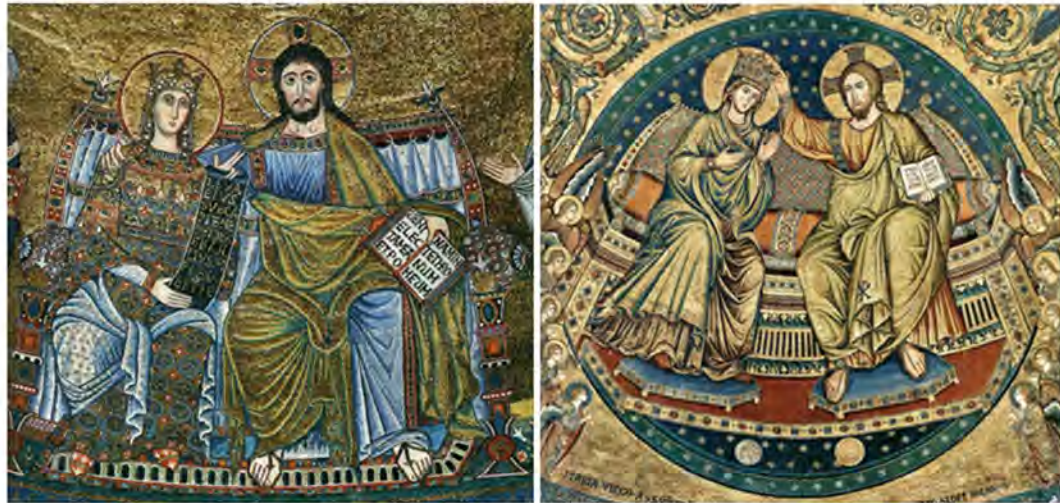
12th century Mosaic in Santa Maria in Trastevere, and 13th century mosaic in S. M. Maggiore, both Rome

But the day came when his Blessed Mother, the spouse of the Holy Spirit, was ready to leave this earth. On orders of the Father, the angels brought her straight to Jesus to be crowned "Queen over all things." (Catechism #966). She was not only to sit at his right hand forever but even to share his throne with him. As Revelation 3:21 says: "I will give the victor the right to sit with me on my throne, as I myself first won the victory and sit with my Father on his throne."