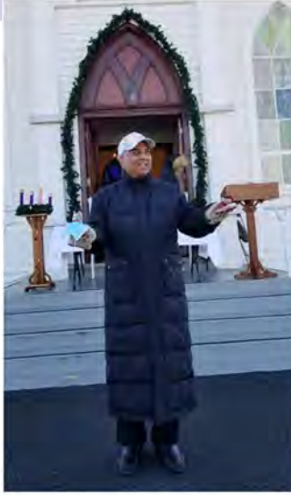
Celebrating mass outside in the cold during Covid