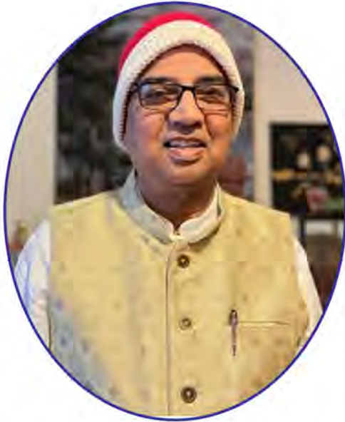
Photo taken Christmas 2023

My dear sisters and brothers in Christ in our parish and beyond, I write this message with a heart full of gratitude and mixed emotions. I would like to share with you and all my well-wishers some significant news.