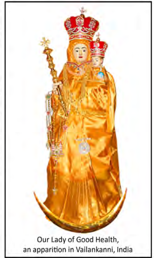
Our Lady of Good Health, an apparition in Vailankanni, India

I know this glorified body will take me all around the universe in the blink of an intention. Like you, I will be able to appear to our children, unhindered by walls or distances.