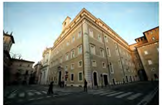
Photo of Pontifical University of Holy Cross, Rome.

In 1999 he went to Rome to study missiology and institutional communication at the Holy Cross University run by Opus Dei for three years. From there he came pretty much straight to San Francisco. What a contrast! He had to learn not only a foreign language, but also a foreign culture and way of being Catholic. It must have taken an enormous amount of compassion, tolerance, and humility to shepherd a much more liberal and much less passionate flock.