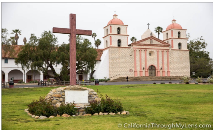
(the California missions are featured in our current bulletins)